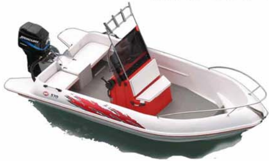
Double Console option **